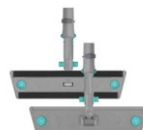
Velook Lampo frame